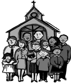
Our Church Family