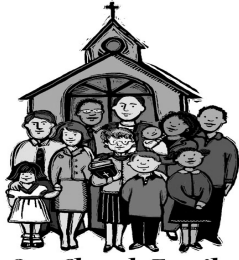
Our Church Family